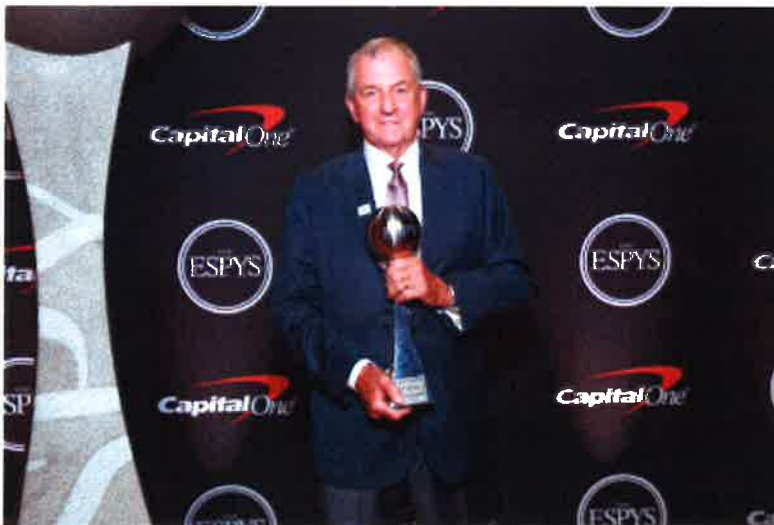
Jim Calhoun Accepts "Best Coach" Award at ESPYS Ceremony